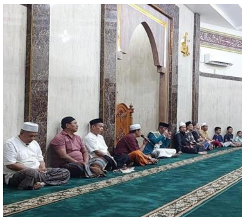
Figure 1. Qur'an reading coaching activities at Amar Ma'ruf Mosque

The portrait results of the activities of the Mosque Kenaziran Board activities in improving the ability to read the Qur'an for worshippers at the Amar Ma'ruf Mosque in picture 1 and figure 2 as follows: